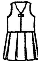
Drop Waist Jumper "Red Dot Green Plaid"